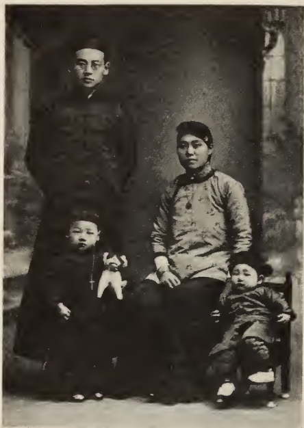
"THE FAMILY OF ONE OF OUR YOUNG CLERGY"

are sharing their small rooms so that we may use a teacher's bedroom with one window for a class room, and the principal's office, as usual, is turned into a class room. There is no place in the building for children when they are ill, not even a dispensary for dressings. During the past year we have had an epidemic of trachoma requiring dressings every day. For this the patients have been taken, with much inconvenience, to the hospital dressing rooms which proceeding has required considerable attention on the part of the already overworked hospital force. A small dispensary in the school would make a resident Chinese nurse possible. Vaccination parties, once a year, infected chilblains to be dressed every day in winter, etc., etc., all must be done in the small room which goes by the name of the principal's office which is anything but—